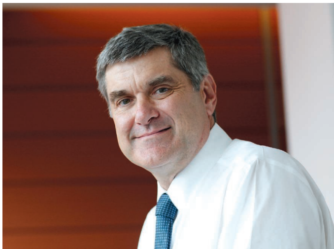
Full circle. By tweaking insulin signaling, Craig Thompson and others have induced high-glucose metabolism in mice.

Recent evidence of the power of this signaling pathway comes from work by David Sabatini of MIT's Whitehead Institute and Nada Kalaany, who's now at Children's Hospital Boston. In 2009, they showed that PI3K appears to determine whether a tumor responds to calorie restriction. When they induced different types of human cancers in mice and then put the mice on semistarvation diets, some of the tumors shrank in response and some didn't. Tumors grew less in the mice with low PI3K pathway activity, more in those with high activity.